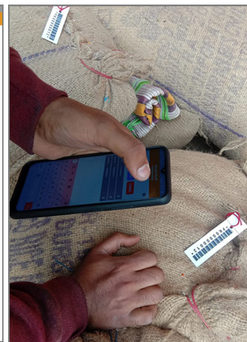
LRPs scanning the barcode on maize bags through Produce Aggregation module

For more info visit: http://www.cdfi.in/projects